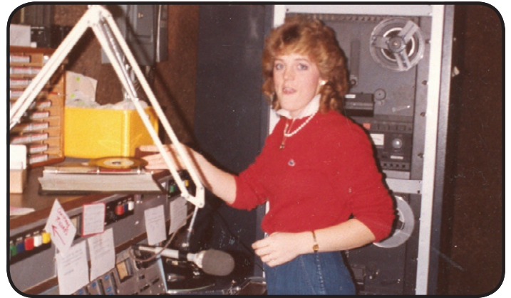
WSDP's Main Studio in early 80's

Know as much as you can know about the world, technology, politics, literature, music, all facets of culture. I studied philosophy in college and I'm surprised by how often I reference my education. If you're interested in a career in media, become acquainted with as many forms as you can. Learn to write for a newspaper or website, try working in front of and behind a camera. I don't know the future of radio, but I know I love the medium! If you feel the same way, be patient and don't be afraid to work overnights somewhere for really lousy pay after you leave WSDP. That's how you get started. Have fun.