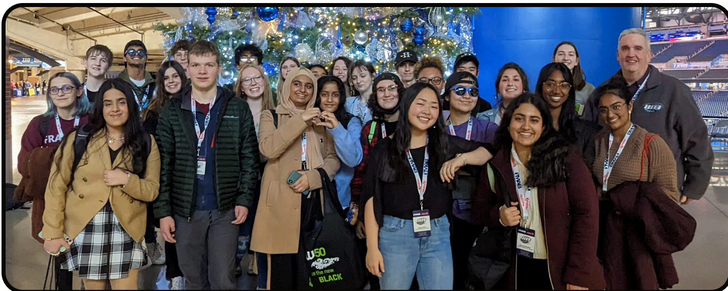
88.1 the Park staff at the Great Lakes Broadcast and Sports Media Academy at Ford Field in Detroit